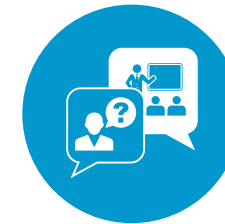
TRAINING AND SUPPORT